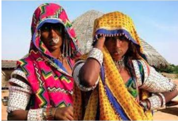
The women belonging to the Koli tribe