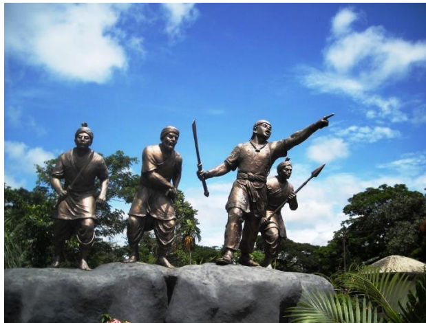
Statue of Ahom warriors near Sivasagar town, Assam