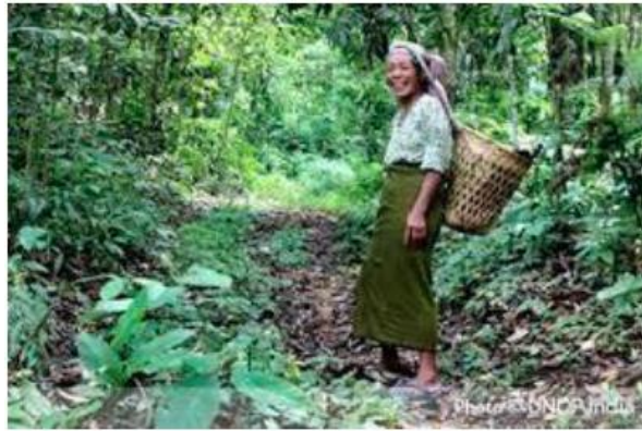
Forests and hilly regions were the main abode of the tribals