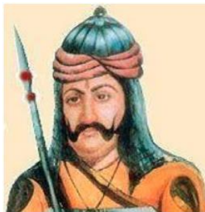
The Rajputs emerged as Kshatriyas in the Indian varna system

Many dominant tribes of Punjab, Sind and North West frontier Province had accepted Islam by this time. They rejected the caste based society.