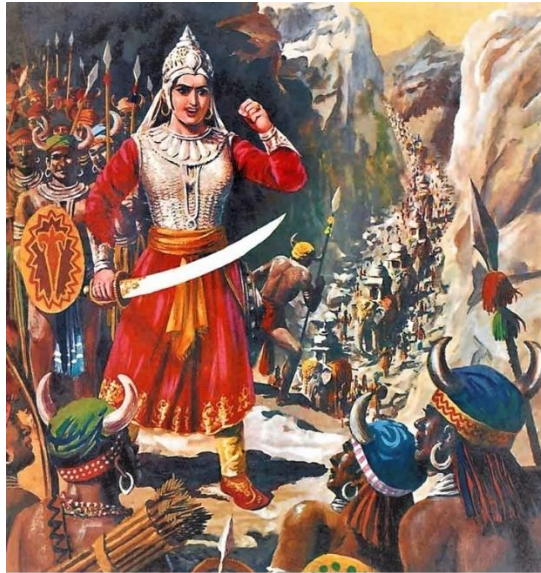
A painting depicting Rani Durgawati inspiring her soldiers for the battle with the Mughals