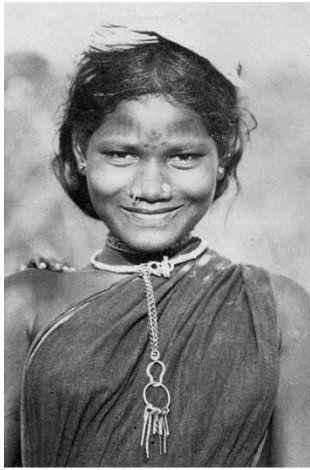
A Gond woman